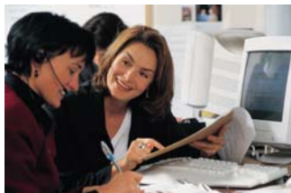
Help build PMI-Montgomery, AL Chapter—Become a volunteer!