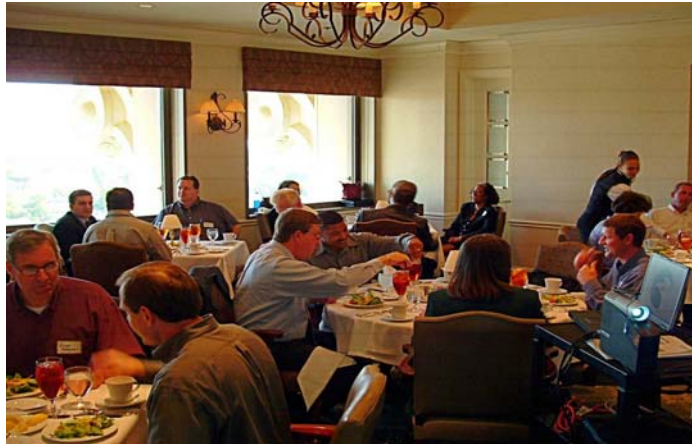
April Dinner Meeting attendees enjoy conversation and a great meal